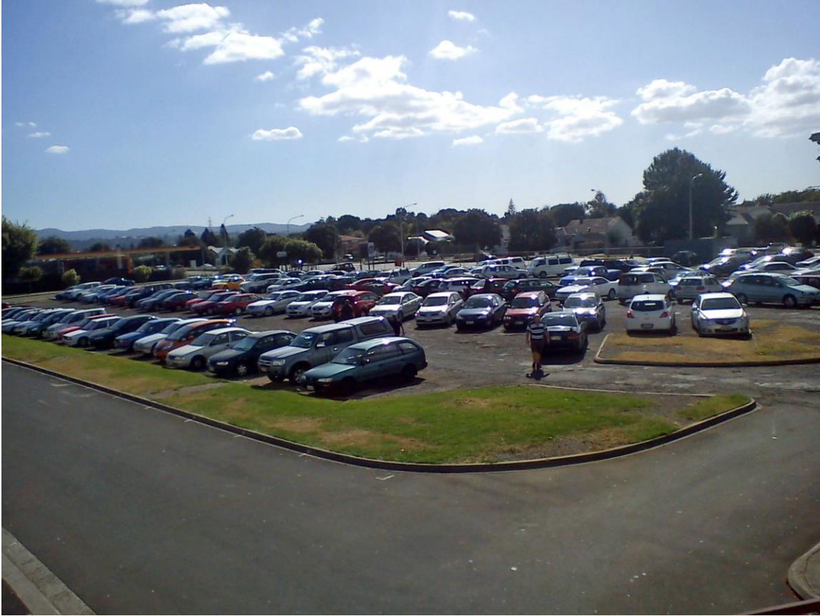
This is a sight that all racing clubs want to see on raceday, the carpark completely full. The total oncourse turnover was $99,526.03 - just short of the $100,000 turnover achieved at the first combined meeting in March 2001.